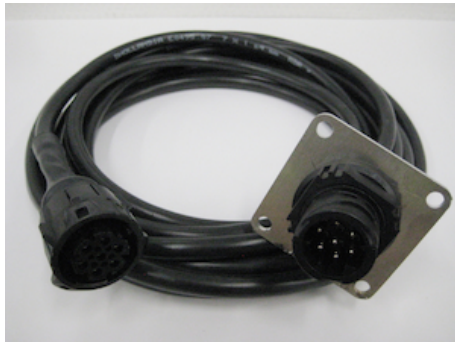
OWE009.06 - 6m extension cable for wand lead