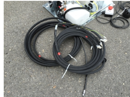
OAH006 - Hydraulic hoses + length