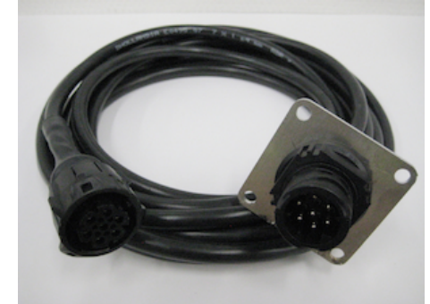
OWE009.04 - 4m extension cable for wand lead