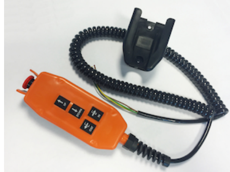
OWH007.0 - Split power pack